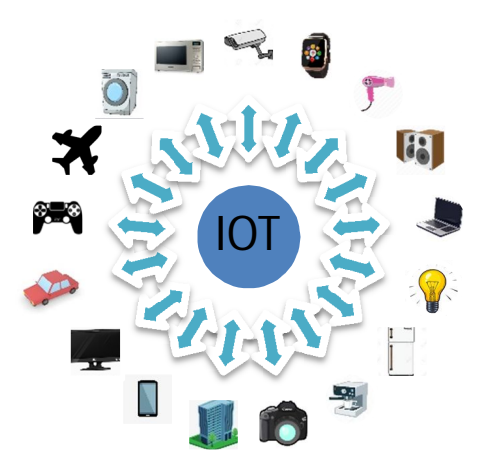
Figure 1.1: Internet of Things