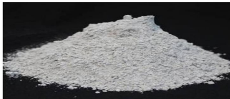
Figure 3.1: Lime Stone Powder

The main objective of this project work is to study the mechanical properties of concrete containing the cement is replacement of limestone powder.