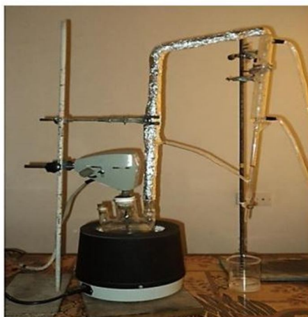
Fig 1 Photograph Clevenger Hydrodistillation

Samples of the botanical fruits were crushed to powder by Mortar and pestle. Then sieved by differential sieve method and separated according to size (10mm i.e. petals, 4.76mm i.e. 4/7 mesh, 2.83mm 7/25 mesh, 0.707mm i.e. 25 mesh). Weighed sample of 25gm was placed in a round bottom flask (1000mL) containing 250mL of distilled water which was attached to a Clevenger type-apparatus. The heat was permitted to go through the samples filled with water. The both liquid (oil+water) were fed through the condenser having an inlet and outlet water ways to the 3-way tap where each liquid are separated by skimming it off the top. Then oil was dried with Sodium Sulphate Anhydrous. The oils were then kept in amber vials and weighed on a potable digital weighing balance. The extraction time was 3 hours.