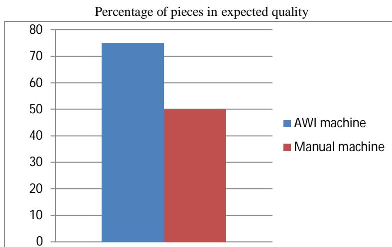
Chart 1: Variation in Rold Gold finishing