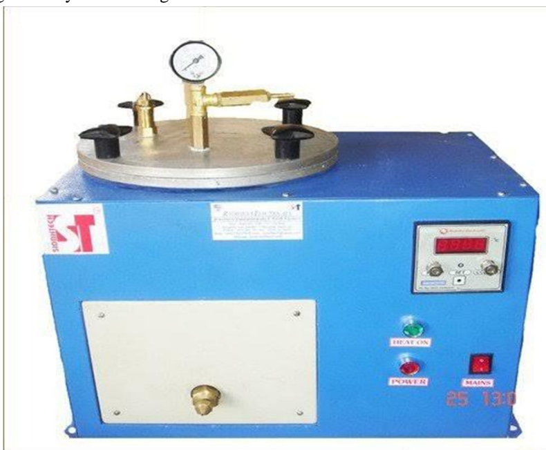
Fig.1.manual wax injector machine

In our project we identified the problem regarding the accuracy level in the production of rold gold jewels. From the detailed survey given by the labors, we found that they are not able to cope with the large scale industries in the automation sector. We also found that the cost of production device is very high. To give a better and simple solution to the above stated problems and to reduce the plight of the labors in the small scale rold gold industries, we programmed the Arduino board using “C” language, and constructed the Arduino controlled automatic wax injector (AWI) machine setup for reducing the overage load of the industry labors for the better finishing accuracy of the rold gold in the short time.