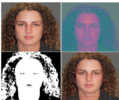
Fig.3.Results of YCbCr color space based face detection method