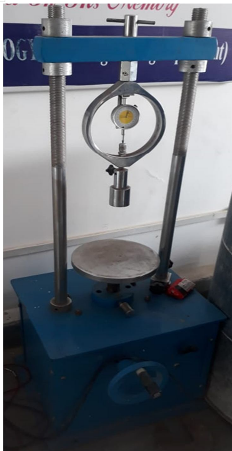
Lab view of CBR Apparatus