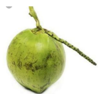
Figure 5: Original image

This section portrays the clustering of coconut images using K-means algorithms. This research involves the following ladders to cluster the images. They are Capture image, Subtract the background, Extract the feature and Cluster the image. Collecting the images is explained in previous section. Then, remaining steps for single image are clearly depicted in Figure 5, 6,7 and 8. K-means clustering plays an important role in grouping the coconut images in the research. Before clustering the images, extraction of features are done by GLCM color feature. Gray Level Concurrence Matrix is used for texture features. In the GLCM number of rows and columns are same as number of gray levels of that image. GLCM is used for number of applications in image processing. Images in database are resized and convert both images into Grayscale. Then the Converted Grayscale images are transformed to binary image. In binary image, count the number of pixels concealed by the images by using GLCM feature.