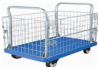
Fig.2(a) Use of trolleys [7]