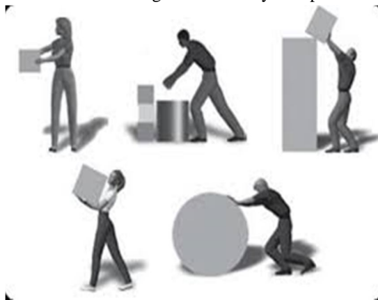
Fig.1 Industrial ergonomics [6]

This paper analyses labour human health and increasing the comfort of the work by which the labour can perform there work effortlessly in the working environment [1]. These found activities by which the labour are facing some health issues inside working environment. To improve work conditions, work tools and work structuring in order for the optimum result to be achieved from and the person at work to suffer as few setbacks as possible[2]. Ergonomics deficiencies in the work place may not result in immediate body pain but over time the body's ability to adapt fails resulting in muscle disorders [3]. Ergonomic should be seen not as finding problems but rather as giving solutions to the problems and can be applied to any industry. Ergonomic is concerned with the 'fit' between people and their technological tools and environments [4]. It takes account of the user's capabilities and limitations in seeking to ensure that task, equipment, information and the environment suit each user [5]. The scientific discipline concerned with the understanding of interactions among humans and other elements of a system, and the profession that applies theory, principles, data and methods to design in order to optimize human well-being and overall system performance.