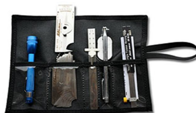
Fig.2(b) Inspection tool kit [8]