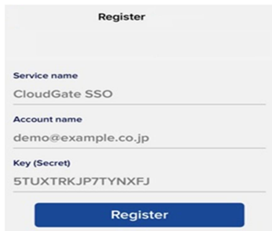
Fig. 2 User Registration with the decryption key

The experiments are performed using the TOMCAT 7.0 and MYSQL 5.0 version. The computations are performed using Toolbox that is readily available in TOMCAT. In Fig. 2, user login screenshot, here user can give their register account name and key for getting entry into the environment created using the proposed system. Fig 3 is a sample file permission key that was created to test the computation response. Every application access was scheduled with security terms.