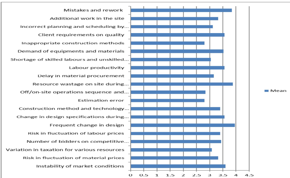
Fig. 3. Average index for cost related factors

The average indices for all factors are calculated. Frequency analyses are done for all factors and main factors which affecting cost are given below.