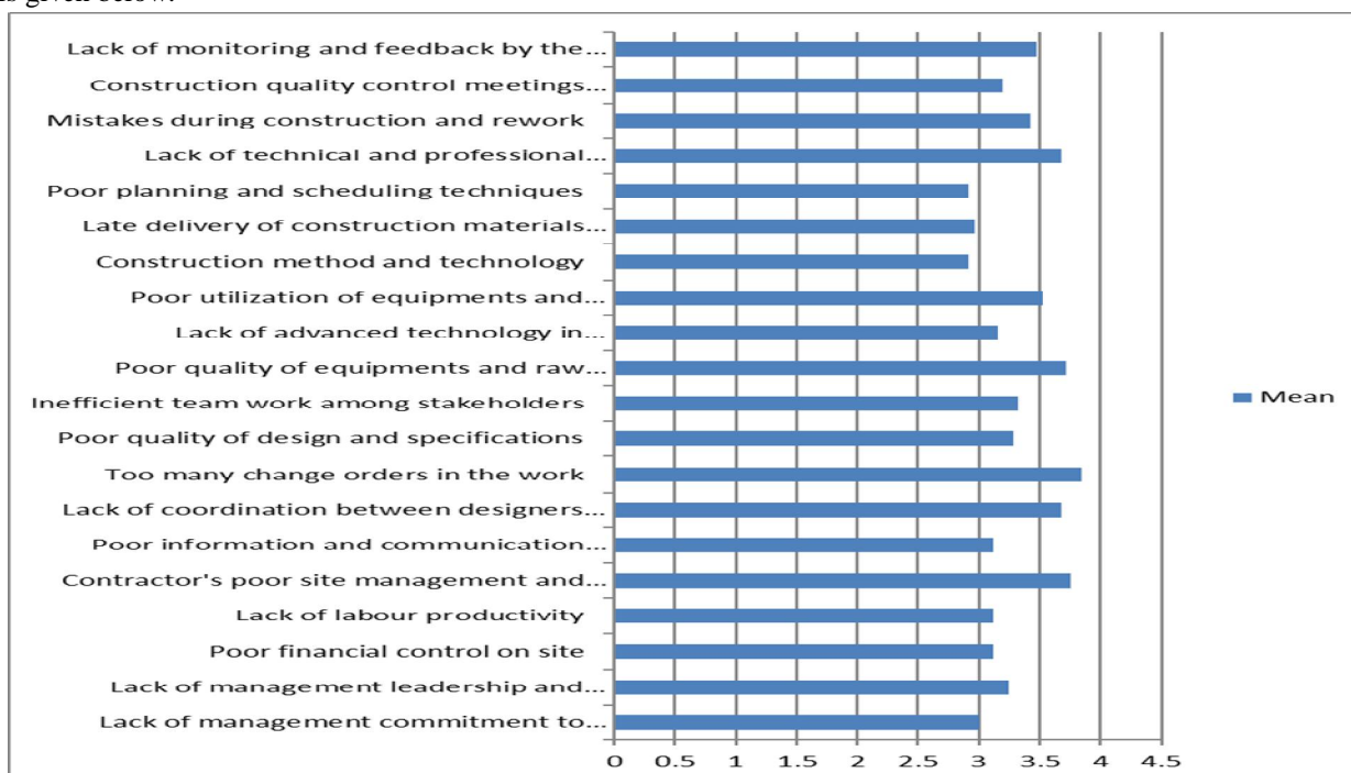
Fig.4. Average index for quality related factors

The average indices for all factors are calculated. Frequency analyses are done for all factors and main factors which affecting quality is given below.