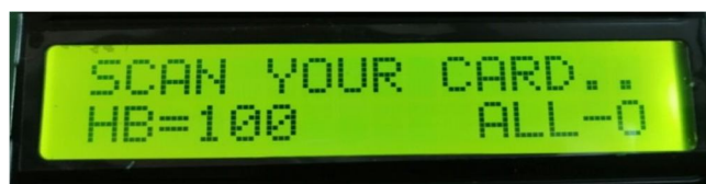
Figure 2: LCD Showing to scan the RF-ID card