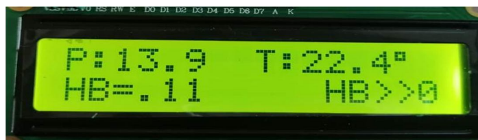
Figure 3: LCD displaying all the three values P=> Ph value, T=> Temperature, H=> Heartbeat per second