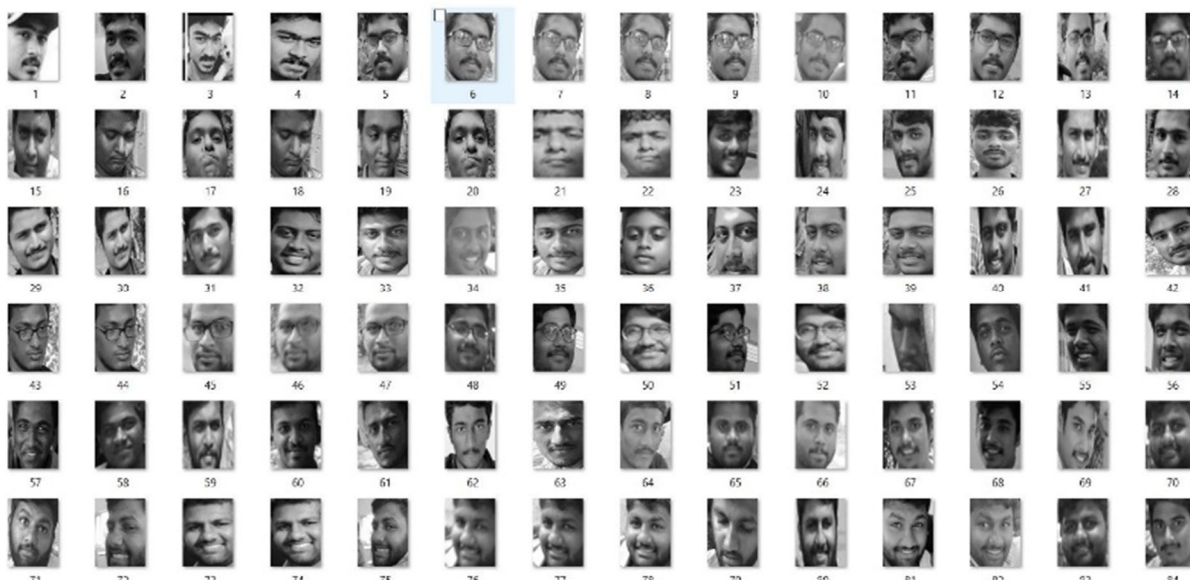
Fig 2.2 Train database.