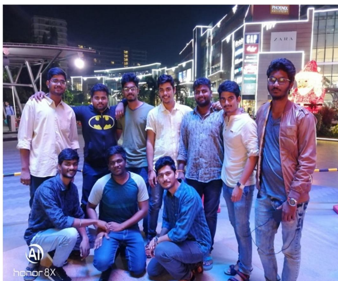
Fig 3.1 Input image.

In this paper, the proposed technique is applied on our own student database using MATLAB 2018b software. The input image that we have taken is as shown in fig 3.1