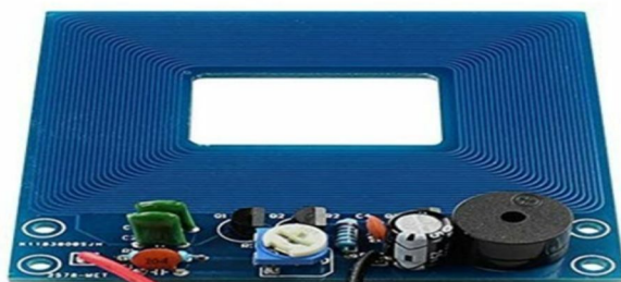
Fig:4.2 metal detector

Here the metal detector Dictate metal and separate it from Biodegradable and Non-biodegradable Waste.