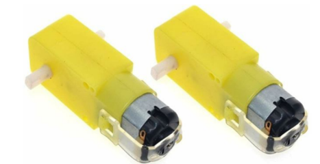
Fig:4.3 dual shaft motor

Dual shaft motor is the small 9 volt motor with the small mechanism Where when the current flow to the motor start Rotating and both the shaft of the mechanism Start Rotating with the Motor. The Dual shaft Motor is used to make a obstacle to the waste which is dictated By the sensors and make them to fall down from the belt to the dustbin of the Biodegradable Or Non-biodegradable Or Metal.