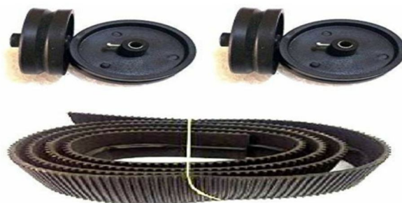
Fig:4.6 Conveyor Belt

Today there are different types of conveyor belts that have been created for conveying different kinds of material available in PVC and rubber materials. Material flowing over the belt may be weighed in transit using a beltweigher. Belts with regularly spaced partitions, known as elevator belts, are used for transporting loose materials up steep inclines. Belt Conveyors are used in self-unloading bulk freighters and in live bottom trucks. Belt conveyor technology is also used in conveyor transport such as moving sidewalks or escalators, as well as on many manufacturing assembly lines. Stores often have conveyor belts at the check-out counter to move shopping items. Ski areas also use conveyor belts to transport skiers up the hill. Industrial and manufacturing applications for belt conveyors include package handling, trough belt conveyors, trash handling, bag handling, coding conveyors, and more.[12]