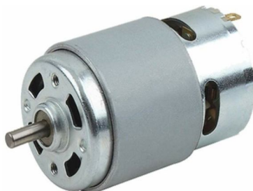
Fig:4.7 DC motors

DC motors were the first form of motor widely used, as they could be powered from existing direct-current lighting power distribution systems. A DC motor's speed can be controlled over a wide range, using either a variable supply voltage or by changing the strength of current in its field windings. Small DC motors are used in tools, toys, and appliances. The universal motor can operate on direct current but is a lightweight brushed motor used for portable power tools and appliances. Larger DC motors are currently used in propulsion of electric vehicles, elevator and hoists, and in drives for steel rolling mills. The advent of power electronics has made replacement of DC motors with AC motors possible in many applications.