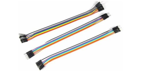
Fig:4.4 Jumper wire

Though jumper wires come in a variety of colors, the colors don't actually mean anything. This means that a red jumper wire is technically the same as a black one. But the colors can be used to your advantage in order to differentiate between types of connections, such as ground or power. Jumper wires typically come in three versions: male-to-male, male-to-female and female-to-female. The difference between each is in the end point of the wire. Male ends have a pin protruding and can plug into things, while female ends do not and are used to plug things into. Male-to-male jumper wires are the most common and what you likely will use most often. When connecting two ports on a breadboard, a male-to-male wire is what you'll need.