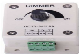
Fig:4.5 volt regulators

Electronic voltage regulators are found in devices such as computer power supplies where they stabilize the DC voltages used by the processor and other elements. In automobile alternators and central power station generator plants, voltage regulators control the output of the plant. In an electric power distribution system, voltage regulators may be installed at a substation or along distribution lines so that all customers receive steady voltage independent of how much power is drawn from the line.