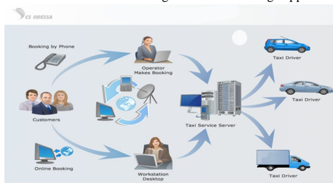
Figure III. System work flow diagram

Using an android application owner can book the vehicle service in advance. On that particular date the owner put the vehicle for the service. When the vehicle service is done the owner of service station will inform the vehicle owner. Now the owner will pay the bill. [4] The bill be generated online. At the last vehicle owner can give feedback through application. [5]