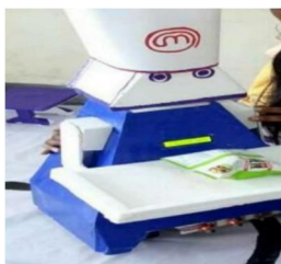
Fig.1 Design of the robot

The Robot works on the principle of line following and path detection using infrared sensor. The infrared sensors are attached in the front of the robot. Four DC motors are fixed to the base of the robot which is used for maneuvering along the path. The path is T-shaped closed loop. All the components such as motor driver IC, microcontroller, voltage regulator IC are mounted on the 0- level PCB. This robot is a general purpose robot and it can be used in various other places such as hospitals, restaurant, hotels etc.