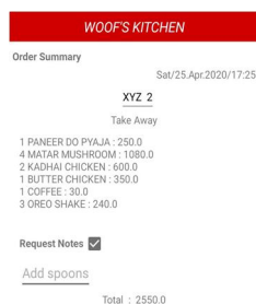
Fig.5. Received Order