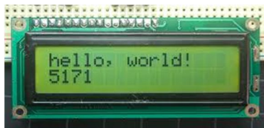
Fig 3: LCD display

A liquid-crystal display is a flat-panel display or another electronically modulated optical device that uses the light-modulating properties of liquid crystals combined with polarizers. Liquid crystals do not emit light directly, instead of using a backlight or reflector to produce images in color or monochrome