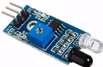
Fig 2: IR Sensor

An infrared (IR) sensor is an electronic device that measures and detects infrared radiation in its surrounding environment. Infrared radiation was accidentally discovered by an astronomer named William Herchel in 1800. While measuring the temperature of each color of the light (separated by a prism), he noticed that the temperature just beyond the red light was highest. IR is invisible to the human eye, as its wavelength is longer than that of visible light (though it is still on the same electromagnetic spectrum). Anything that emits heat (everything that has a temperature above around five degrees Kelvin) gives off infrared radiation.