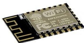
Fig 4: Wifi Module

The ESP8266 WiFi Module is a self-contained SOC with integrated TCP/IP protocol stack that can give any microcontroller access to your WiFi network. The ESP8266 is capable of either hosting an application or offloading all Wi-Fi networking functions from another application processor. Each ESP8266 module comes pre-programmed with an AT command set firmware, meaning, you can simply hook this up to your Arduino device and get about as much WiFi-ability as a WiFi Shield offers (and that's just out of the box)! The ESP8266 module is an extremely cost-effective board with a huge, and ever-growing, community.