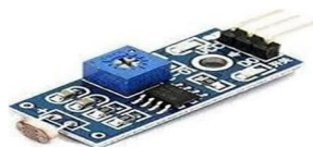
Fig.1 LDR sensor