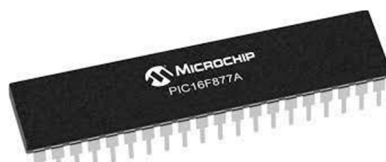
Fig.3 PIC16F877A microcontroller