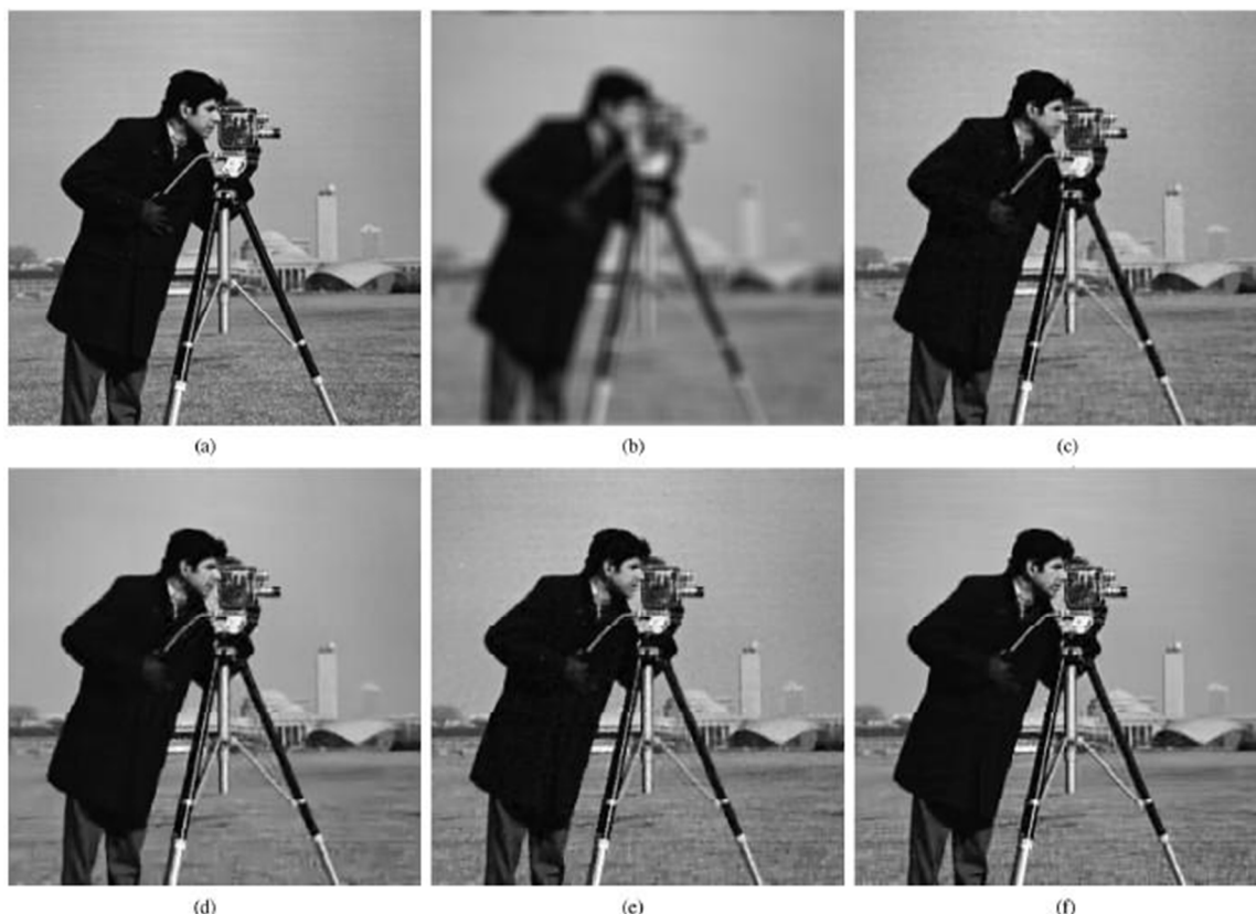
Fig. 5 comparison of original cameraman images, noisy blurred image (BSNR = 40 dB, 9 \times 9 uniform blur) and deblurred images by different algorithms); a) Original image; b) Noisy blurred image; c) TVMM (ISNR = 8.48 dB); d) SADCT (ISNR = 8.57 dB); e) IST (ISNR = 8.65 dB); f) fine-granularity and spatail-adaptive regularization (ISNR = 9.96 dB).