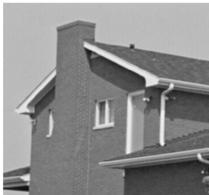
Fig. 3 Original Image

It is proved by applying Eigen value analysis to the linear system. Eigen vectors associated with blurring operator \mathbf{H} and the corresponding Eigen values \lambda_{mn} . the term fine-granularity is used to emphasize the increased flexibility in manipulating the procedure of relaxation control. In addition to r-times Landweber iteration. It is feasible to combine it with a spatially adaptive control strategy. Original image of cameraman is shown in figure 3 and the output image obtained using fine-granularity is shown in figure 4.