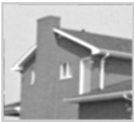
Fig. 2 Denoised Image Using Iterative Regularization

The value of unified projection-based framework is that it allows us to understand various image deblurring algorithms in a principled manner. From this perception, many deblurring algorithms based on different heuristics and can be viewed as a combination of sequential and parallel projections strategies, any iterative image deblurring algorithm has been called relaxation control, which is abstractly equivalent to regularization.