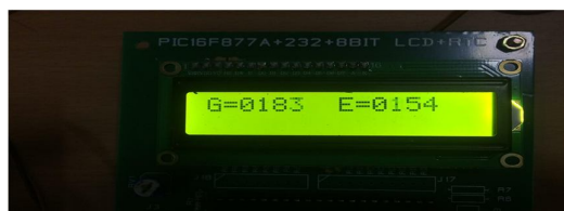
Figure 3. Output of both EEG and Gas sensor

Figure 2 shows the different types of waves that occur in the brain that can be calculated using EEG sensor. The Beta wave works when we are in consciousness and in awake, Alpha wave works when we are in relaxed and in creative visualisation, Theta wave works when we are in problem solving, Delta wave works when we are in dreamless sleep. All the output waves are shown in the digitalized form.