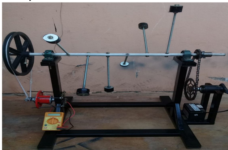
Fig .gravity powered electrical generator