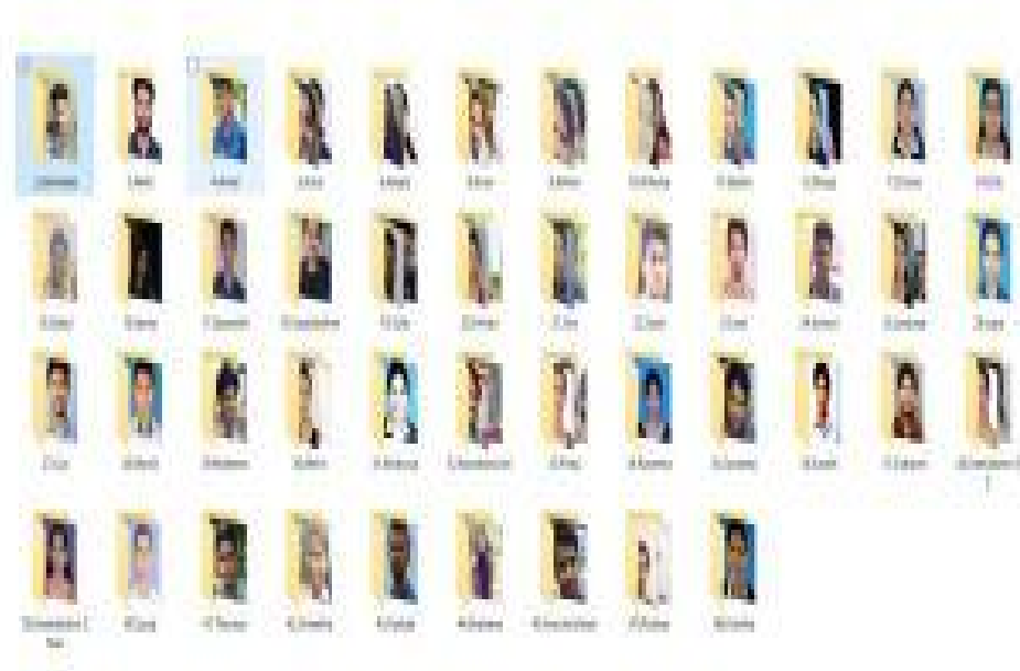
Fig. 2. Dataset

While we tend to used OpenCv to facilitate face recognition, OpenCv itself wasn't answerable for distinctive faces. The tasks involved are detection of faces, extraction of 128-dimensions face encodings, train a Support Vector Machine (SVM) on top of the encoding, recognition of faces in images. When we apply face detection, then which detects the presence and location of a face in an image. Then extract the 128-dimension feature vectors. After that SVM has been trained on the encodings. Our training dataset is created with images of each student. Face recognition API generate face encodings for the face found. In face encoding face will be represented using a set of 128 features of face. The system starts with processing the image for which we want to mark the attendance. The basic phase is the image capturing phase from which we start initializing our system by capturing images of the students. We capture an image from a camera. We take different frontal postures of individuals.