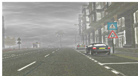
Fig4: Output haze free image using WCID algorithm