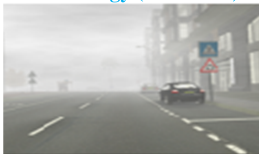
Fig2:input hazy image