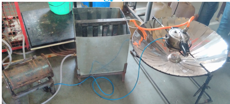
Fig. 1 Fabrication of Solar Absorption Refrigeration System