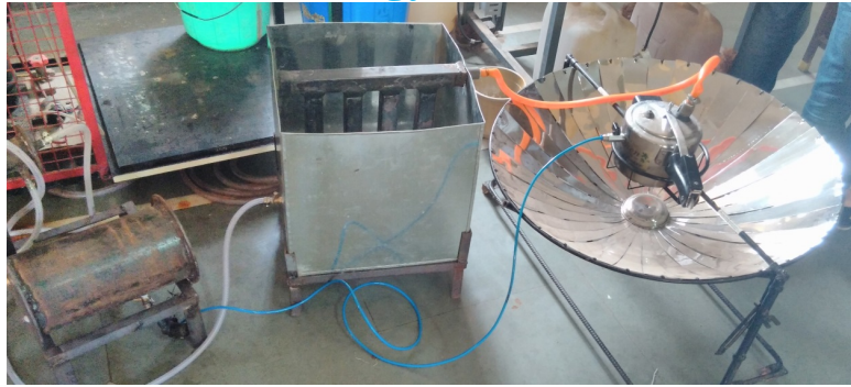
Fig. 1 Fabrication of Solar Absorption Refrigeration System