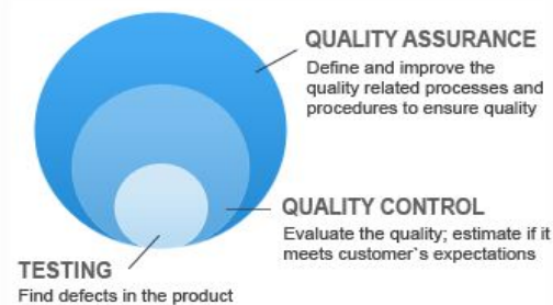
Figure 1. Software Quality Assurance [9]

It can be suitably defined as a set of organized activities which provide proof of the ability of a software process to generate a software product which is suitable to use [3].