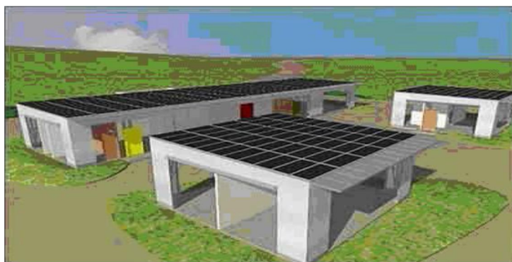
Fig 2: An Example of Prefabricated Structures Simulated Solar Energy and Generating Electrical Energy and Water Treatment Systems

The method, developed or improved building is also called, include: the performance of individuals and the professionals mentioned in the previous method of mechanical machinery and equipment for the purpose of adding speed and Hjmkar required. Buildings with steel or concrete structure in this division are in order. The construction of some of the instruments and equipment used are: Electric hoists, cranes variety of fixed and mobile, metal scaffolds, made of concrete and mortar fixed and mobile devices, Symanpash and paint machines, welding machines and speed of execution of construction works in this method, 20 to 28 hours on a per sqm to average. In other words, the speed of implementation of construction operations can be used up to two times increase of mechanical and electrical equipment. Due to the use of metal and concrete structure, number of floors and building height up to 100 floors and 400 meters can be predicted. Initial investment to implement this method, the volume of construction operations and purchase or lease the equipment is considerable. Work stoppage due to labor issues or financial problems of negative points and may be harmful latest-project. less time and with efficiency and safety are made.