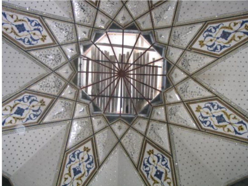
Fig 3: arch steel elements during assembly in the image

In this method pieces such as blocks, joists, precast panels, beams and columns of steel and concrete, metal nets, pieces of plaster and concrete and so on. And most operations using the equipment and the mechanical workshop. Page Kfrazhhay integrated metal types such as Kfrazhhayay, tunnels, slippery modulated and Kfrazhhay made of lightweight materials and plastic Kfrazhhay ups and sliders in this way to concrete Sry about the use of the buildings are in four seasons. The number of people working in this way in terms of expertise and the quantity is less than the previous methods, but the quality should be technical experts and high level of skill and precision.