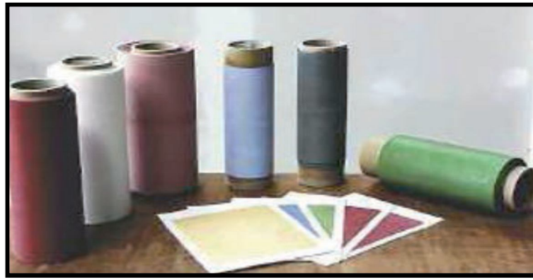
Fig 4. Ceramic Plates with Cnc-Flex Nanotechnology Coating Processes Are Thinner And More Flexible Production

Multifunctional: other examples of nanotechnology-based coatings, films (var p in) flexible ceramic, wall tiles in the kitchen and places health as used in the manufacture of a flexible ceramic substrate with glue (crosslinking) is used. Next, the ceramic composite ceramic paint and a colorless garment worn. In addition, other functions such as anti-UV properties and hydrophobic properties are to be added at a later stage. As a result, widely and easily with features multi-functional wall coverings withstand pollution, fire and chemicals is made.