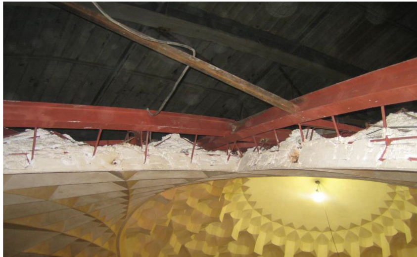
Fig 1: The Gap between Irons That Are Stainless Joinery With Due

Iran 34 hours in European countries is 24 hours per sqm. Amount of initial investment to implement the work by this method was too small and the number shovel, pick, barrow, Fvrghvn, tanks, barrels and timber and the progress of construction and the building does not exceed the client's tastes building materials purchased. This method has been intermittent stages of construction operations. For example, the construction of the side walls would Foundation after the operation is possible. Any interruption in one of the prolongation of the implementation of the building and has created lengthy intervals. If the project is in an area filled with rain and rain will continue for 20 days and is in process of Dyvarchyny basement, electrical wiring storey building Dvmayn consequently be postponed for at least 20 days. The sequence of the work force is in addition to the financial losses caused Dmamkan planning. Now in most big cities or rural areas or around certain buildings (such as mosques) of these construction methods are used