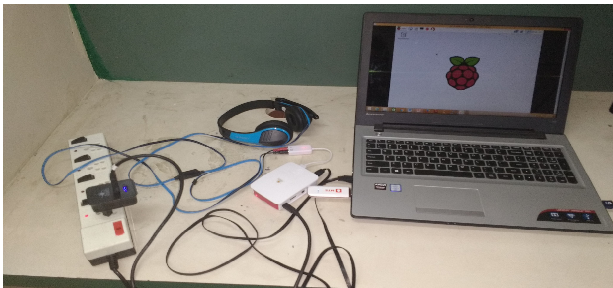
The Figure 4.2 raspberry pi 2 model b