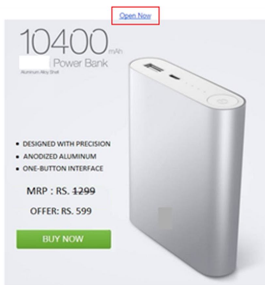
[ Fig. 1: Attractive e-mail image ]

The Terrorist group creates online shopping offers attractive e-mail and sent it to the victim. In this e-mail power bank shopping discount image and one link is provided for more know more about the power bank details as shown in a figure.