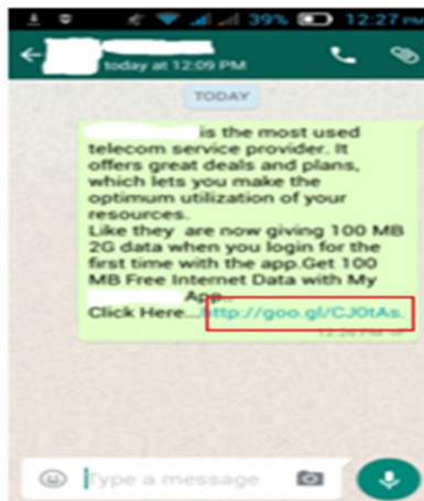
[ Fig.4 Attractive Message ]

figure showed that in Whatsapp sent an attractive message with a malicious link.