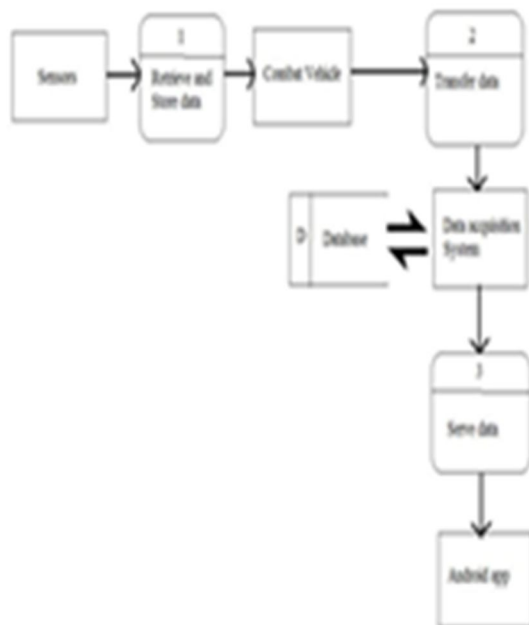
Fig.2 Data Flow

The overall view of the application be like fig3,4