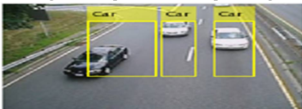
Figure 2 Sample video after processing