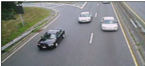
Figure 1 Sample video without processing

using the display unit which is incorporated at particular distance.