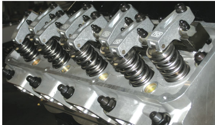
Fig. 2 Rocker arm on Engine Head

The drive cam is driven by the camshaft. This pushes the rocker arm up and down about the trunnion pin or rocker shaft. Friction may be reduced at the point of contact with the valve stem by a roller cam follower. A similar arrangement transfers the motion via another roller cam follower to a second rocker arm. This rotates about the rocker shaft, and transfers the motion via a tappet to the poppet valve. In this case this opens the intake valve to the cylinder head.