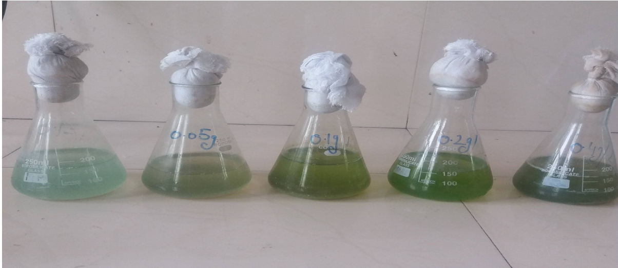
Fig. 1 Biomass concentration of Chlorella sp. in different concentrations of \text{KNO}_3 . On 12 th day (exponential phase)

The microalgae were isolated from sewage water by serial dilution method. Chlorella pyrenoidosa was identified by microscopic examination. The culture was grown in Fogg's media autotrophically and with different concentration of \text{KNO}_3 in media. Different concentration used was 0%, 25%, 50%, 100% and 200% of control.