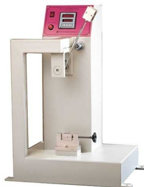
Figure 2: Picture of Digital Impact Testing Machine

Digital Impact testing machine which is used which is shown in figure 2. A sophisticated data gathering algorithm might be expected to adjust the rate of data collection in conjunction with varying rates of change in load or strain, and so on. Most testing machine is intended to be used in routine testing and permits the information such as impact energy, and other statistical analysis of