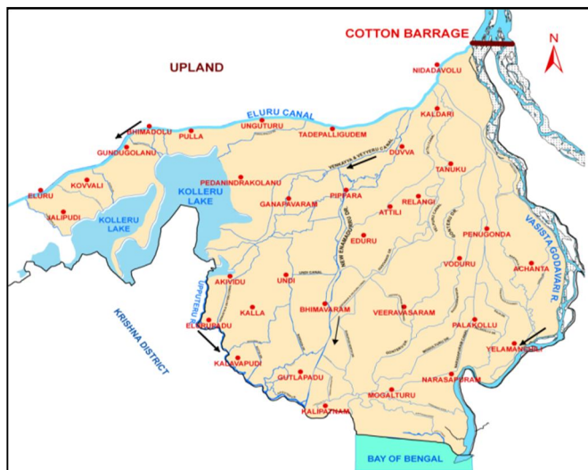
Fig 1: Study area of six streams

West Godavari is one of the 13 districts of Andhra Pradesh, India. West Godavari district occupies an area approximately 7700 square kilometers. It has 46 mandals: out of which 20 are in Upland and the rest in Deltaic region. The delta region is abundant with water sources and so agriculture, aquaculture and industries are surviving with these abundant water resources. Irrigation in West Godavari is carried on through a network of streams, namely Eluru stream, Narasapur stream, Venkayya Vayyeru stream, Gostani Velpur stream, Attali stream etc.