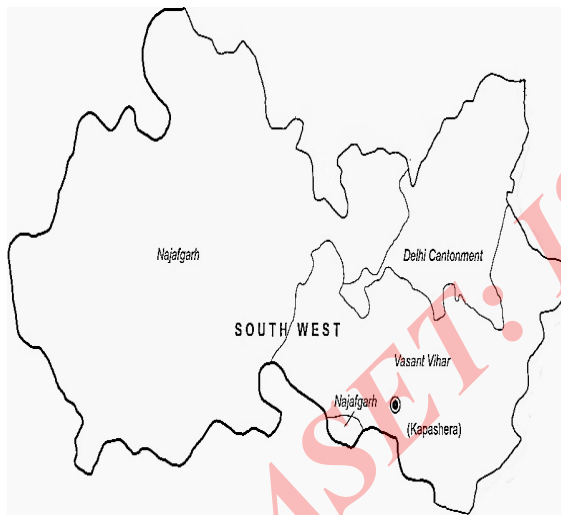
Figure-3. Map of south-west district of NCT Delhi.

The South-West district of NCT Delhi (Figure- 3) covers 420 sq. km. with a population density of 4,166 persons per Km 2 . Administratively; the district is divided into three Subdivisions: Delhi Cantonment, Najafgarh, and Vasant Vihar.