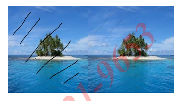
Fig 9 Elapsed time is 67.97 seconds. 46.36 iteationsr=20; Noori et al's Algorithm

Fig 8 Elapsed time is 629.12 seconds. PSNR 79.84 iterations=50 Bilateral filtering Algorithm