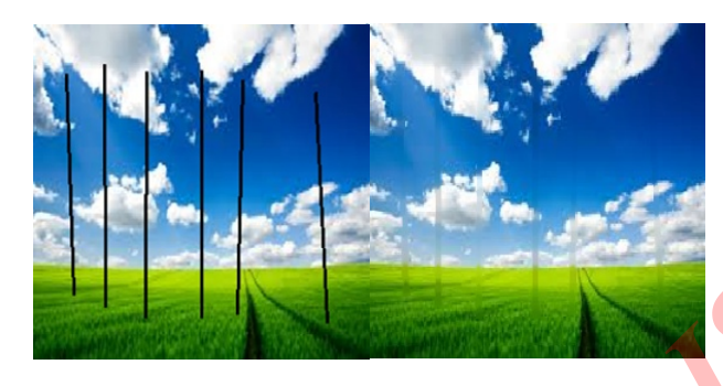
Fig 7.Elasped Time 85.45 seconds. PSNR 51.14 iterations=100