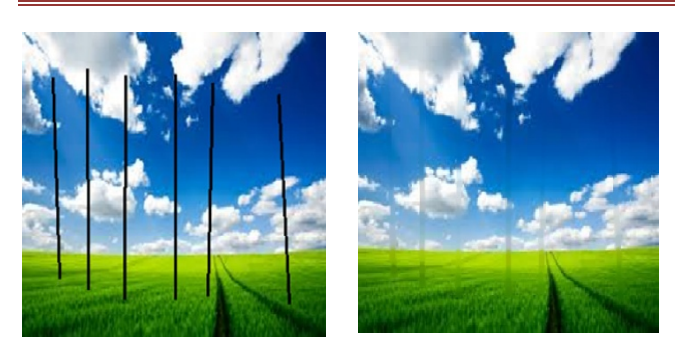
Fig 6. Elapsed Time 62.36 seconds. PSNR 51.14 iterations=70;