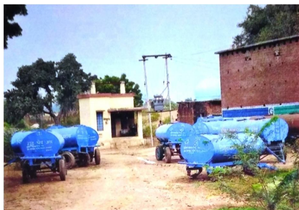
S 1 - Charkhari Baipass

Total six water samples were collected in summer season 2015, from different stations (Charkhari baipass, Bhatipura, Subhash Nagar, Ram leela Maidan, Bajaria, Navnirmmit Charkhari Baipass) in Mahoba city (Table-1) all the samples were collected in sterilized bottles D.O. bottles and were stored at 4 0 C till further investigation, samples were collected from the sites in between 9.30- 11.00 am, Physico chemical analysis of water samples were carried out using standard methods APHA (Trivedy and Goel 1980). Physico-chemical factors colour, Turbidity Taste, odour, PH, total hardness, Total dissolved solids, chloride and D.O. Fluoride, and total alkalinity were analyzed as per the methods given in APHA (2005).