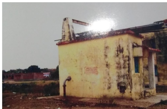
S 2 - Bhatipura