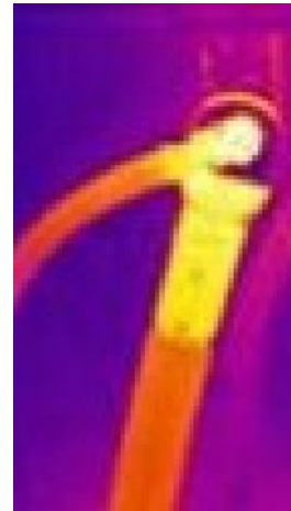
Fig-2. Infrared thermal image.