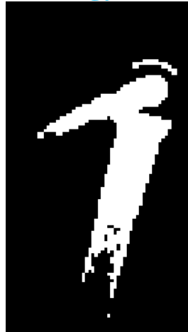
Figure 3. Thresholded image