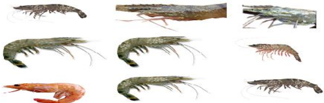
Fig. 3 Database of shrimp

The main drawback for in computer vision methods is lack of suitable database of images. Huge amount of images must be collected from various data sources for the task of building a very good database. The images of shrimp must be collected from ports, labs, harbours, field etc. which are all remote areas. All images of these shrimp suffering from disease must be captured with cameras. Detecting the diseased shrimp is difficult because of water turbidity. Those shrimp must be removed from water for taking images properly. Like that thousands of images are required which is very difficult. Therefore underwater cameras must be required to capture the shrimp images. If the images are not proper then there is no use of automating the system. Therefore the database should have the images of high quality as shown in fig 3.