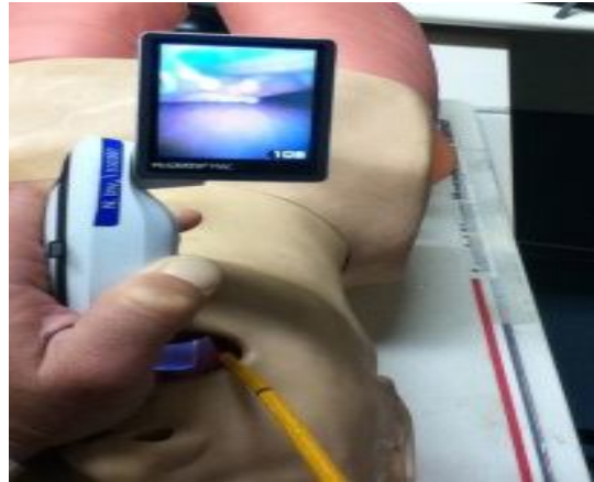
Figure 4 : over video laryngoscopy

The patients were placed in the supine position with their head on a 7 cm headrest. General anaesthesia was induced according to the preference of the attending anesthesiologist. The attending anesthesiologist decided when to start the intubation attempt and the time for the procedure was then noted.