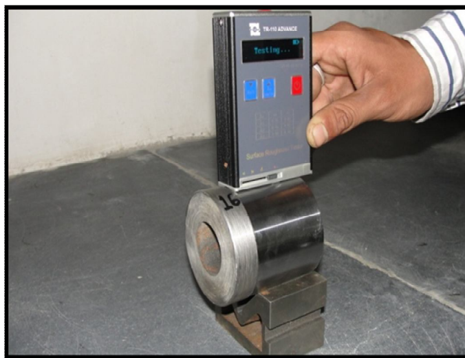
Fig 3 Surface roughness Measurement

The surface roughness is measured by MITECH MDT310 Portable Surface Roughness Tester at three different levels of spindle vibration. Roughness measurements on the work pieces have been repeated three times and average of three measurements of surface roughness parameter values has been recorded as shown in figure 6.6. The instrument is a portable, self-contained instrument for the measurement of surface texture. The measurement results are displayed on an LCD screen. The instrument is powered by rechargeable battery.