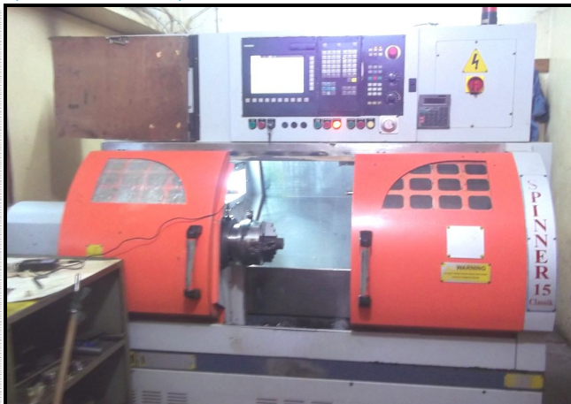
Fig 2 CNC Lathe SPINNER 15