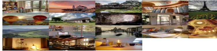
Fig. 1. Input source image sequences contained in the database. Each image sequence is represented by one image, which is a fused image of the sequence that has the best quality in the subjective test.

get nearer or facilitate far from the screen for better perception. Every single subject rating were recorded with pen and paper amid the review. To limit the impact of visual weariness, the length of a session was restricted to a most extreme of 30 minutes.