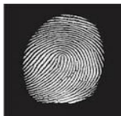
Fig. 1 Finger Print.

in the late 1800s, an anthropologist named alphonse bertillon sought to fix the problem of identifying convicted criminals and turned biometrics into a distinct field of study. He developed 'bertillon age', a method of bodily measurement which got a named after him. Bertillon realized that even if names changed, even if a person cut his hair or put on weight, certain elements of the body remained fixed, such as the size of the skull or the length of their fingers. His system was used by police authorities throughout the world, until it quickly faded when it was discovered that some people shared the same measurements and based on the measurements alone, two people could get treated as one.