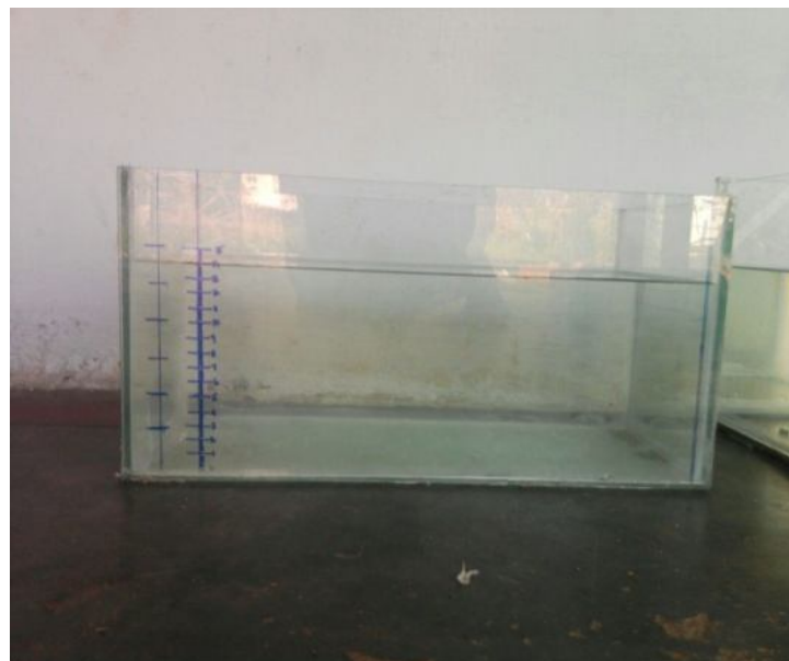
Fig.4..before test the water