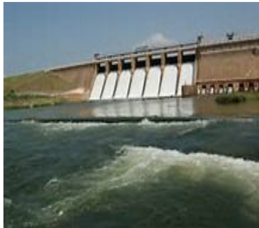
Fig.1. Dam Layout