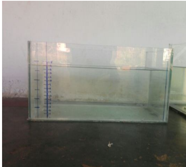
Fig.5. After mixing Of stearyl alcohol in water