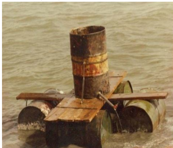
Fig.4.mixing ratio in stearyl alcohol

The monomolecular film formed by a mixture of Stearyl alcohols in 1:5ml provides a stronger and more stable film on water surfaces than single Water Evaporation Retardant (WER) material