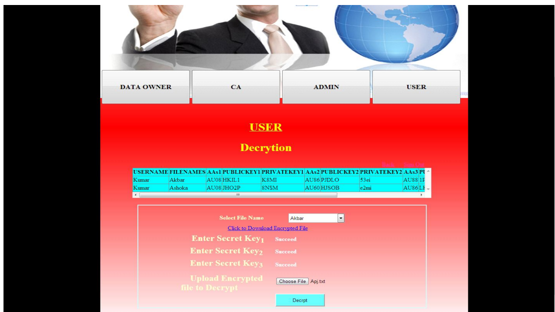
Figure 5: File decryption by User