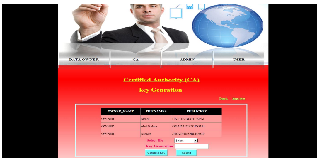
Figure 2: Public Key Generation By CA