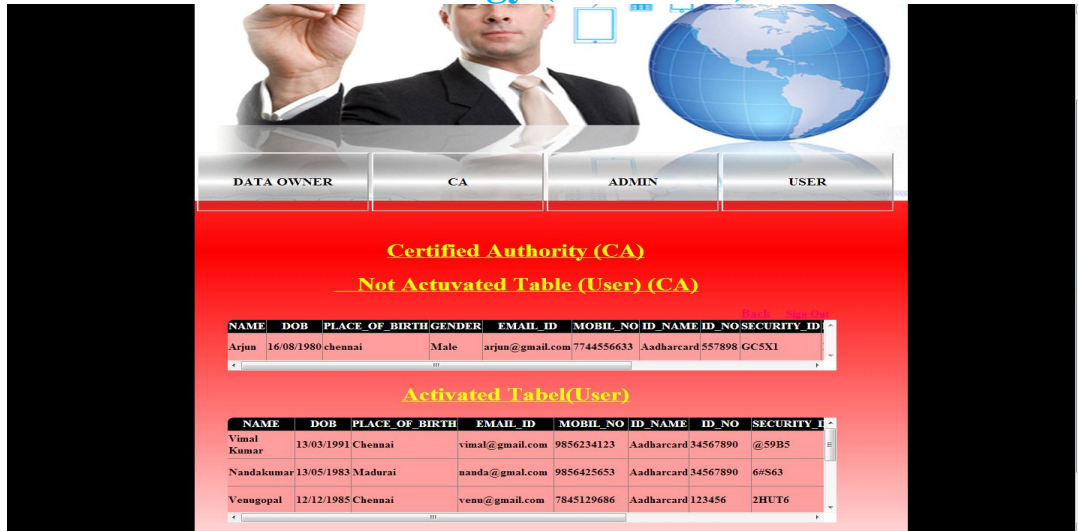
Figure 3: Account Activation by CA