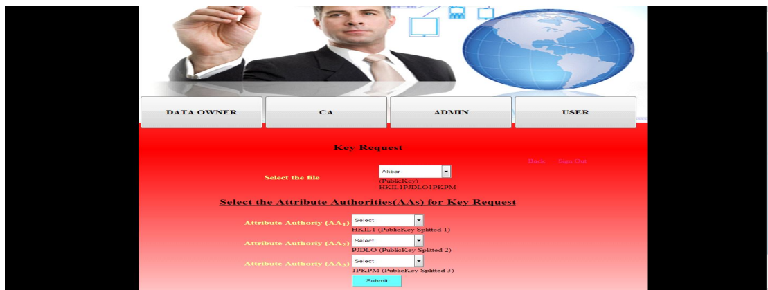
Figure 4: User's Key Request to Admin