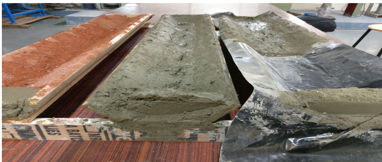
fig 8.2 model making (1 unlined canal, 2 concrete canal, 3HDPE +concrete canal)