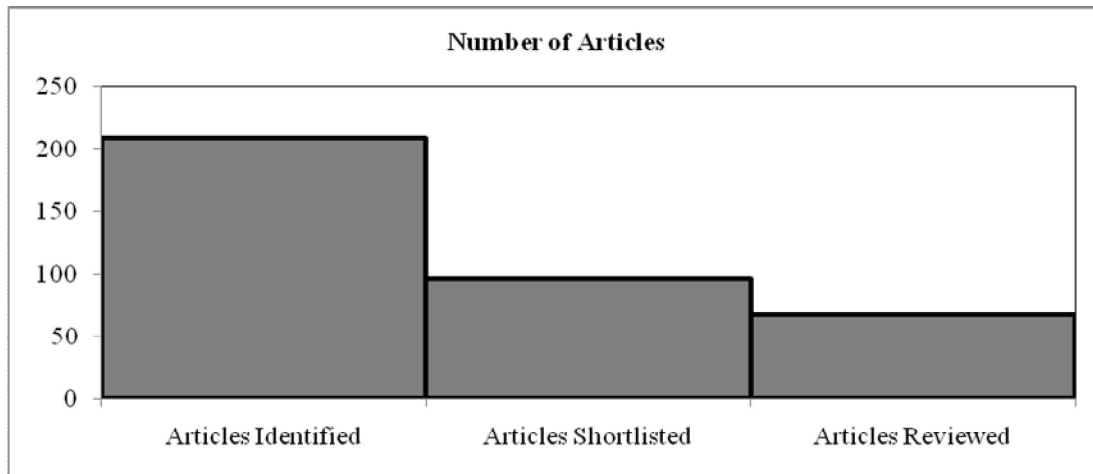
Fig 1. Details of articles shortlisted for review