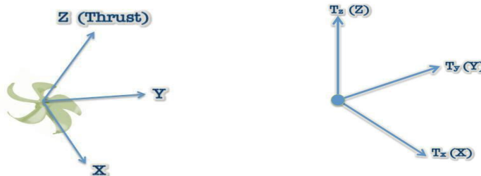
Figure 1: Body Frazme Figure 2: Inertial Frame

The inertial frame is defined with respect to the ground, with gravity pointing in the negative Z-axis. (Fig. 2) The body frame is defined by the orientation of the quadcopter, with the rotor pointing in the positive Z-axis and the arm-extensions pointing in the positive/negative X and Y axes. (Fig. 1) All metrics with respect to either the inertial or body frame are implied in braces.