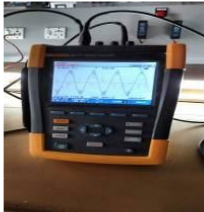
Fig.3.Measurement of Total Harmonic Distortion