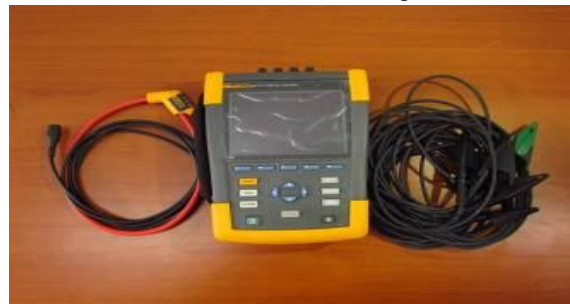
Fig.2.Flukemeter for Power quality indices measurement

IEEE Std.519 (1992) recommends keeping voltage THD \leq 5\% and current THD \leq 32\% in utility power distribution network < 69 kV. ANSI C82.77 (2002) recommends all commercial indoor hard wired ballasts > 28W maintain 0.92. Highest allowable harmonics component per wattage is 3.4 mA (for 3rd harmonic) corresponding to current THD of 78.2%. The total harmonic distortion, or THD, of a signal is the extent of the harmonic distortion in the source current and is the ratio of the RMS amplitude of a set of higher harmonic frequencies to the RMS amplitude of the fundamental frequency. THD can be used to assess the power quality of electric power systems. Low value of THD leads to reduced currents, heating, emissions and lower losses.