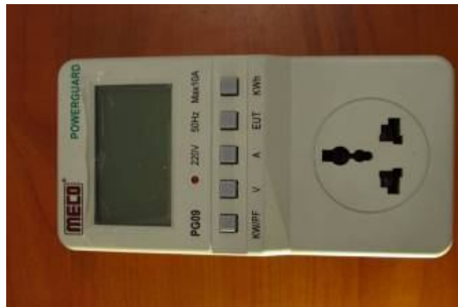
Fig.1.Powerguard meter for PF measurement

High power factor operation leads to higher efficiency, reduction in size of equipments and wires. The utility provides incentive for high power factor operation and levies additional costs when low power factor is involved. Same rated supply can feed 90–95 kW load at unity PF compared to 50 kW load at 0.5 PF. Term PF reflects efficiency of an electrical power distribution system. Loads that cause poor power factor include induction motors, arc furnaces, machining, stamping, welding, variable speed drives, computers, servers, TV, fluorescent tubes, compact fluorescent lamps. Utility charges industries for poor factor but exempts houses and offices.