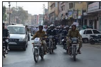
Photo1: Traffic in miraj.

As like the City Stand area of Miraj city, the areas which experience heavy traffic congestion are HeeraChowk and Gandhi Chowk. HeeraChowk is a conected traffic area on Miraj-Sangi Road. The roads for Miraj, Sangli, Ambedkar Road, Pandharpur, and Kolhapur are bifurcated from here. The institutes like MMM College & Gulabrao College; Shivaji Stadium; LIC office; Dargah; many Hotels and Hospital are situated in the vicinity Gandhi Chowk is a conected traffic area on Miraj-Panderper Road. The roads for Pandherpur, sangli, Miraj, Shivaji Statue, Laxmi Market and Kupwad are bifurcated from here. wanles Hospital and Civil Hospital, Laborary, Fuel Station.etc are situated in the vicinity Thus both the conected areaareof great public importance and experience severe traffic problems every day. Hence there is a need of traffic improvement in both the areas.