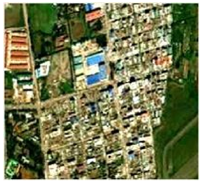
Figure 2: Output good contrast ,high resolution Satellite Image